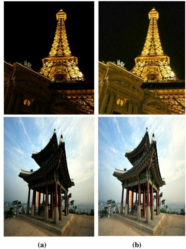
Fig 2: (a) Input Image (b) Output for underexposed portion of image